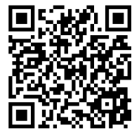
Social Event Testimonials