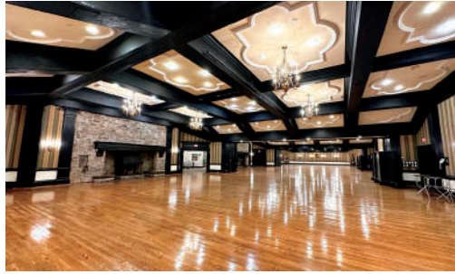
Brule A, B, C